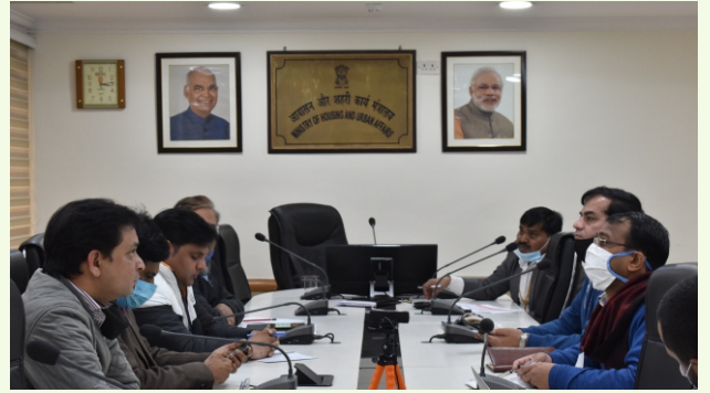
PMAY(U) Team interaction with State/UTs during ARHC online Assessment and Training Programme, New Delhi